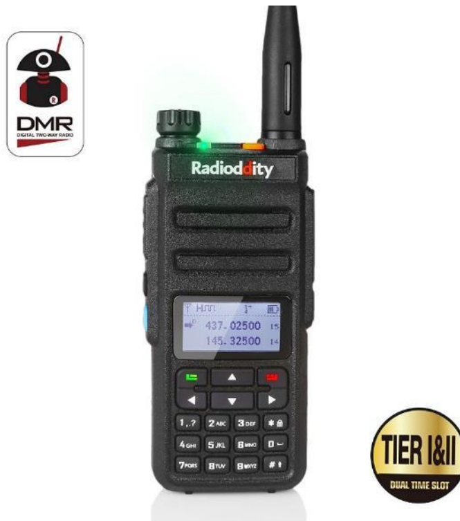
Radioddy GD-77 (dual band, Analog/Digital (tier I/II))

Youtube Video on programing the TYT MD 2017 https://www.youtube.com/watch?v=m6h11Ryp5hU