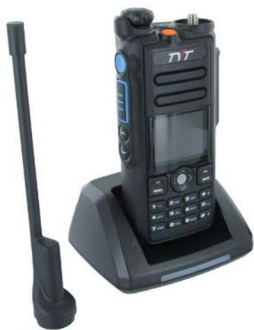
TYT MD 2017